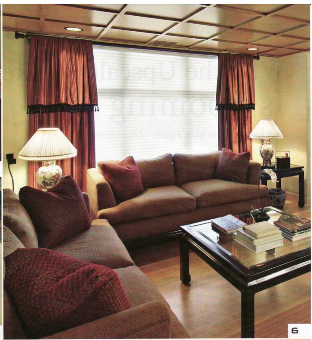
1. Warren Steven's drapery workroom went the extra mile pattern matching the soft treatments. 2. Thick black tassel fringe adds a finishing touch to the draperies. 3. Warren Steven's drapery workroom constructed a custom shower curtain using a Manual Canvas hand-painted linen of Japanese cranes. 4. Custom bedding coordinates with motorized room-darkening draperies. 5. Oversized cornice boards and matching throw pillows with an Asian scenery print help tie together the kitchen, dining and living spaces. 6. Stationary drapery panels with an attached valance highlight this sophisticated Oriental lounge.

was given to all fabrics and details. A distinct black trim pops off the stationary drapery panels in the sitting area, adding to the Asian feel. The shower curtain was constructed using a hand-painted linen of traditional Japanese cranes. A soft, swagged drapery panel in the entry and simple valances in the kitchen suggest a casual elegance anyone can appreciate.